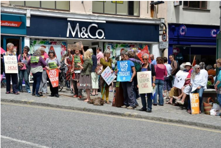
Protesting against Austerity

We organised an Anti-Austerity Demo on Saturday 20 June in Penzance (coinciding with the National Anti-Austerity Rally in London). Amazing Leftie Women, The Cornwall Anti Cuts Alliance, Cornwall Against the Tories and Unite were all represented at the protest. It was a great turnout and the local press coverage in The Cornishman was very satisfying.