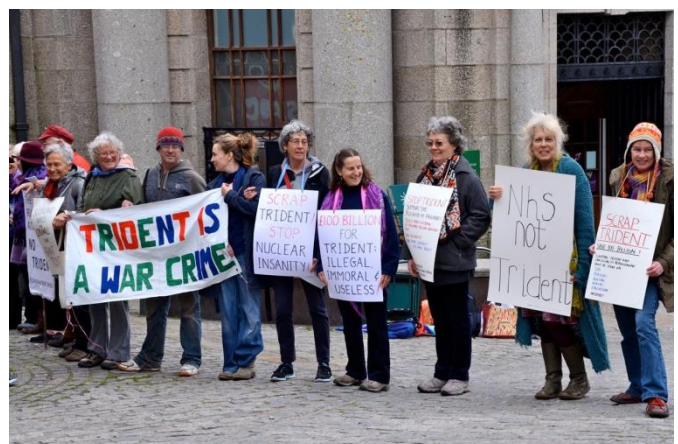
Global day of action against military spending

We invited members of the public to a demonstration to 'link arms against the arms race' outside Lloyds Bank in Penzance on 13 April in solidarity with the blockade at Faslane on the Global Day of Action Against Military Spending. We had a good turnout of approximately 45 people, plus some local candidates for the pending General Election (Green, Liberal Democrat and Labour).