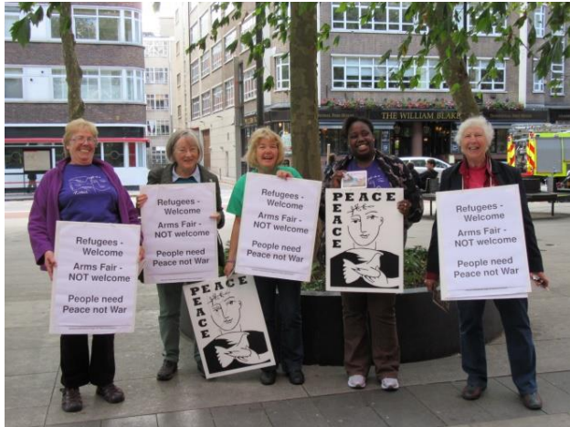
WILPF exec. on the Streets Sept 2015

In September, WILPF presented a joint seminar in London with Pax Christi titled Women as Peacemakers: personal and political.