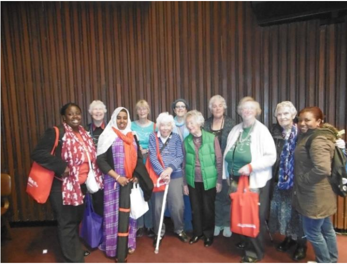
Group from the UK at the Hague

We first met our fellow IB members at the Hague 100th Anniversary Congress last Spring. Each national WILPF section is entitled to an IB member. The UK membership is the only job-share so far, but we've always stressed we still have only one vote between us.