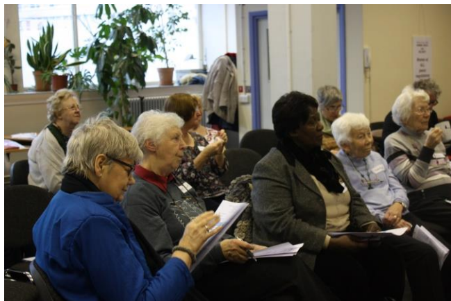
Members at WILPF UK AGM March 2015

This Centenary year has been an extremely busy and exciting one for UK WILPF. The year started with the AGM on 14 March 2015. This AGM took a different format with the business in the morning and the showing of the UK WILPF centenary film "These Dangerous Women", together with a showing of the exhibition banners in the afternoon. For further details of the 20 places where the film and exhibition have been seen in the