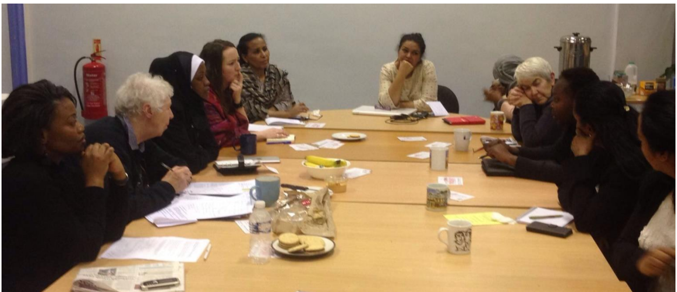
VoAW Meeting with some London WILPF members

Our work for women in Sudan, Darfur, Somalia, Rwanda, Eritrea, DR Congo, Chad has continued throughout the year.