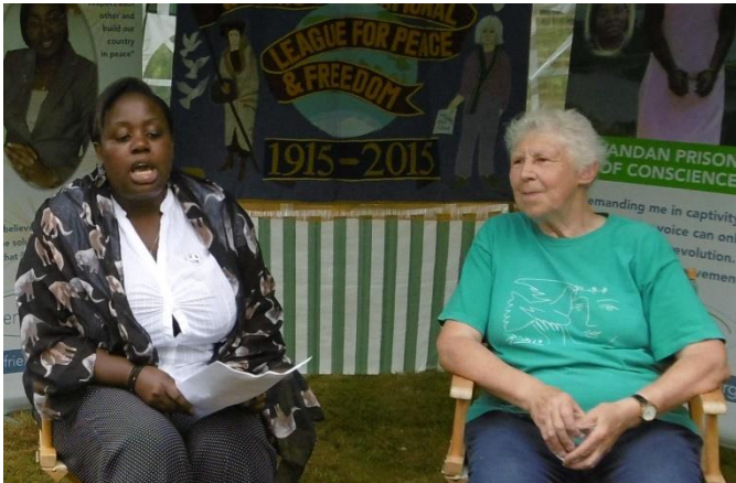
Orpington Garden Party