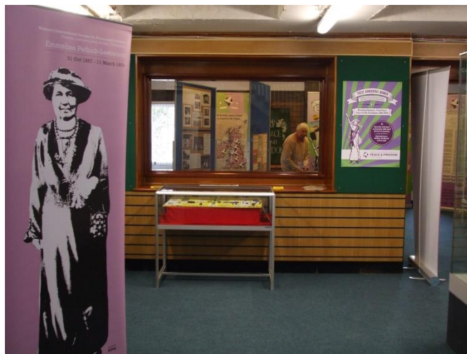
History Exhibition in Orpington

We were very pleased to be given free space in April for two weeks at the Bromley Museum in Orpington for the exhibition. We then discovered how few people visit the Museum. So in May we paid for space in the Bromley Central Library for a week. We were able to have a rota of members sit with the exhibition, interact with the public, and give away “These Dangerous Women” booklets throughout the time it was on display in both locations.