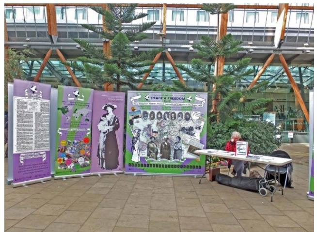
Exhibition at the Winter Gardens, Sheffield, March 2015

27 – 28 March Winter Gardens exhibition with banners