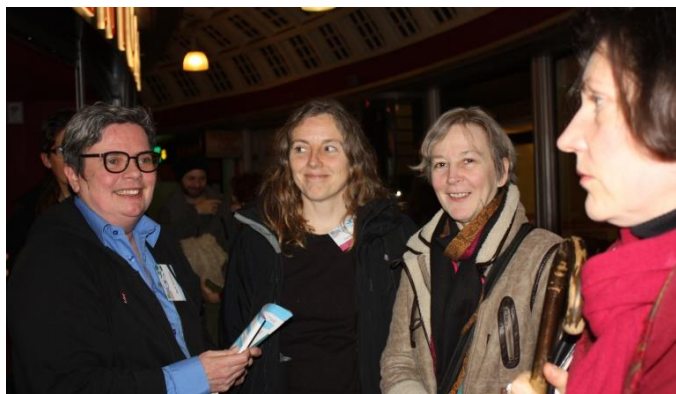
'These Dangerous women' in Brussels at the end of January

The film was broadcast on 28 April by the Community Channel and received 11,000 views. It was also shown at the Bertha Von Suttner building in The Hague, Netherlands, on 28 April to invited European historians.