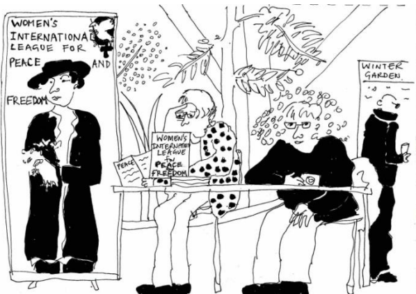
Exhibition at the Winter Gardens, Sheffield

In March, we showed the centenary exhibition for two days in the Winter Gardens, with two people in two-hour shifts covering the days. Being in a prominent position, it attracted many passers by.