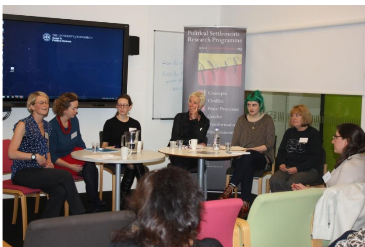
Workshop Edinburgh University