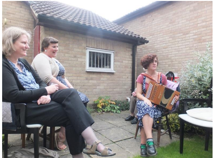
Sheffield Annual Garden Party

In October, we showed the centenary film “These Dangerous Women”. In November, we ran our usual stall at the Sheffield Peace and Craft Fair where we gave out information and sold crafts to help our much needed funds. Finance is always a concern as our room hire costs and rail fares for the Executive Committee Representative continue to increase.