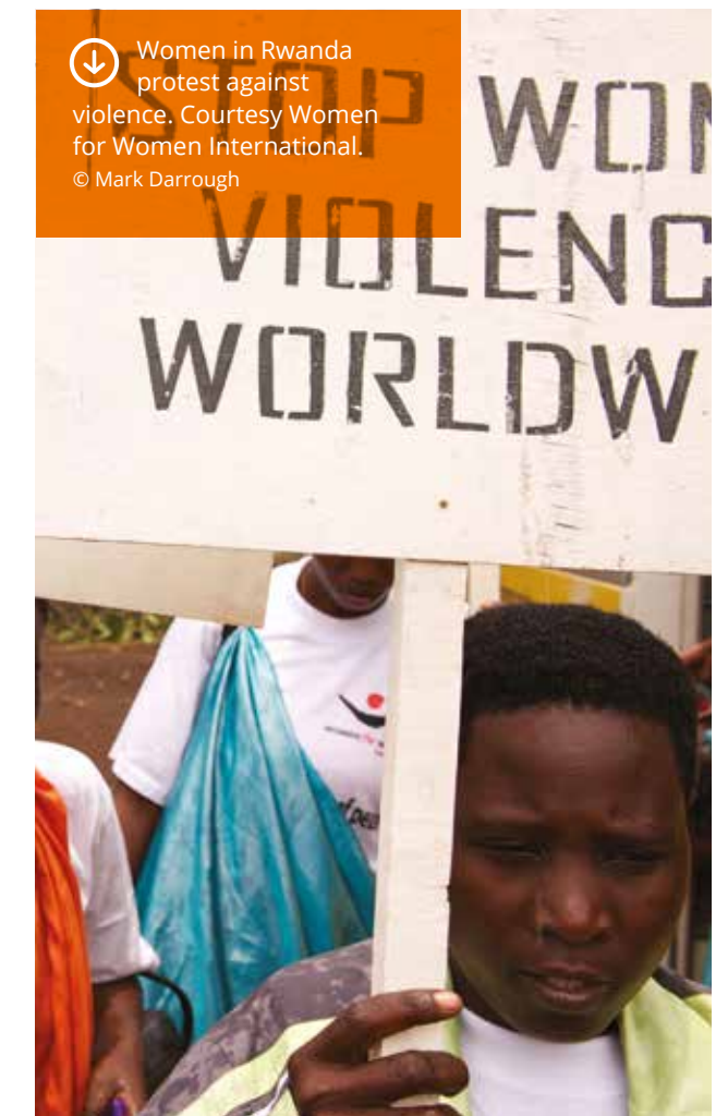
↓ Women in Rwanda protest against violence.

Finally, the UK government should work towards the full realisation of women and girls' human rights as its primary objective. While GAPS notes the increased interest and commitment from the MoD and the