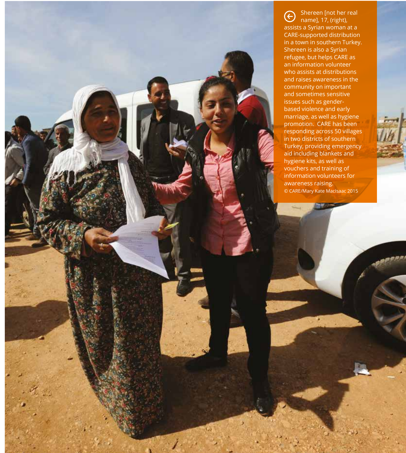
← Shereen [not her real name], 17, (right), assists a Syrian woman at a CARE-supported distribution in a town in southern Turkey. Shereen is also a Syrian refugee, but helps CARE as an information volunteer who assists at distributions and raises awareness in the community on important and sometimes sensitive issues such as gender-based violence and early marriage, as well as hygiene promotion. CARE has been responding across 50 villages in two districts of southern Turkey, providing emergency aid including blankets and hygiene kits, as well as vouchers and training of information volunteers for awareness raising.