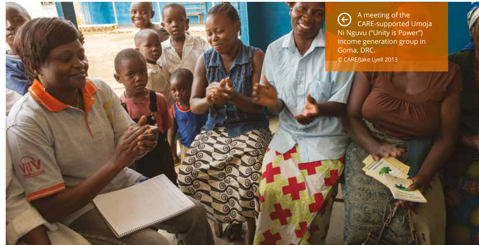
← A meeting of the CARE-supported Umoja Ni Nguvu (“Unity is Power”) income generation group in Goma, DRC.

GAPS strongly welcomes the UK government's bi-annual consultation meetings with GAPS members in London, which provide an opportunity to share priorities from member organisations and partners based in conflict-affected countries. Positively, the UK government, as part of the development process for the current NAP, provided funding for consultative workshops in three of the focus