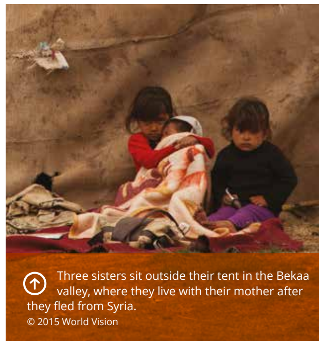
↑ Three sisters sit outside their tent in the Bekaa valley, where they live with their mother after they fled from Syria.