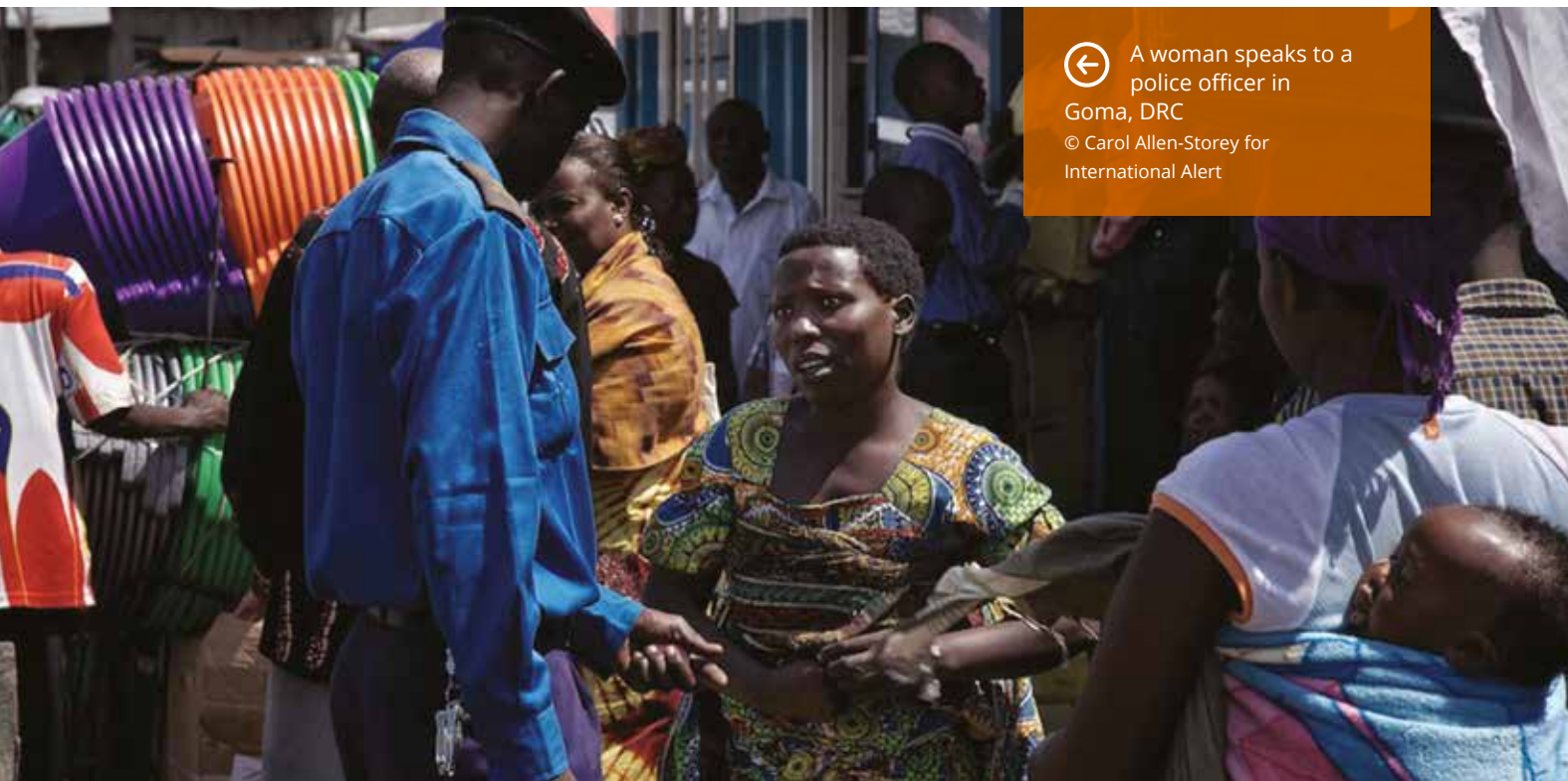
← A woman speaks to a police officer in Goma, DRC