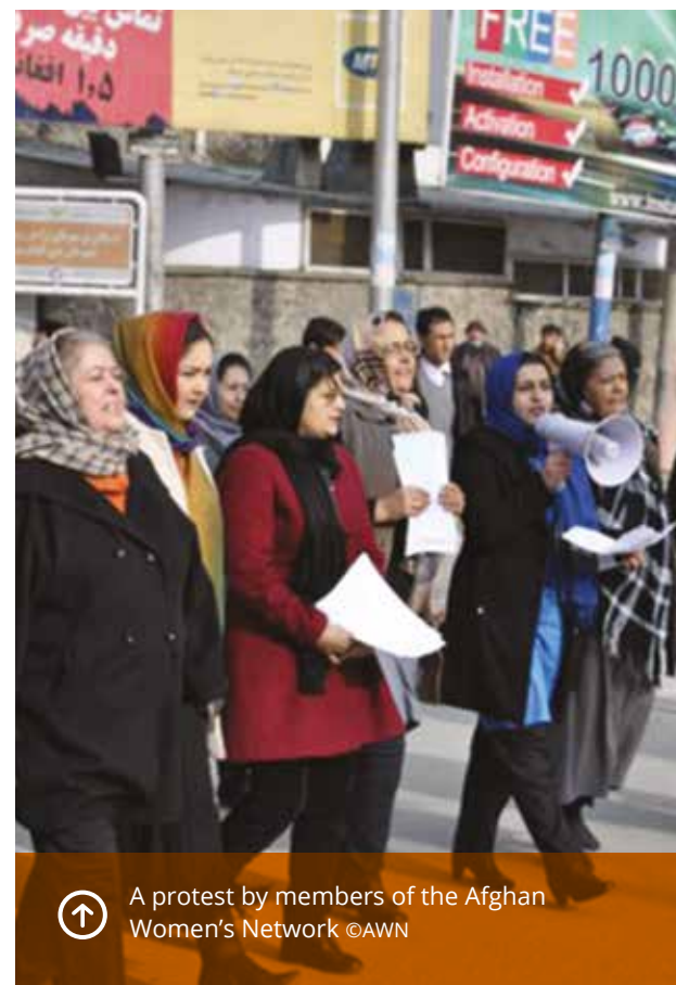
↑ A protest by members of the Afghan Women's Network