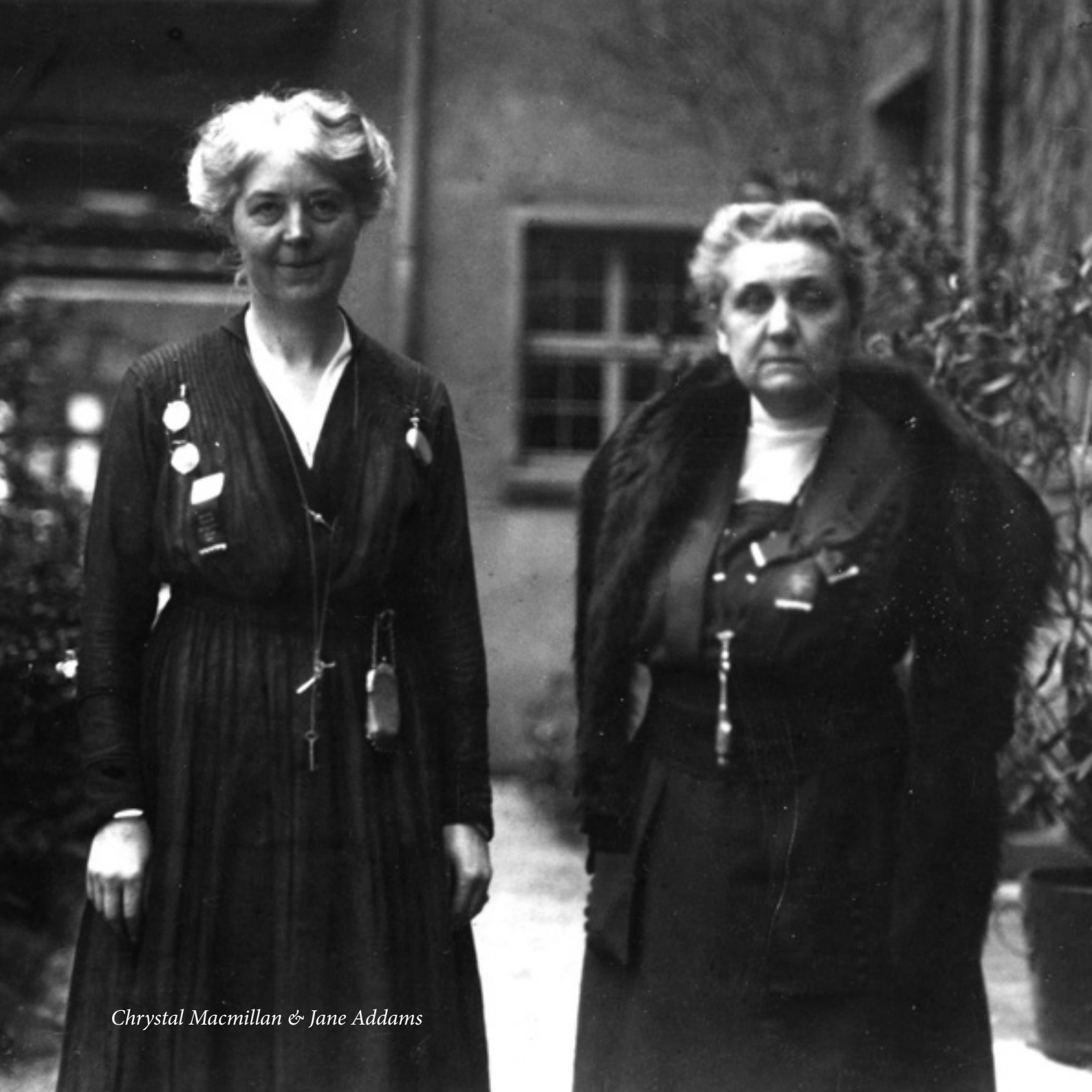
Chrystal Macmillan & Jane Addams