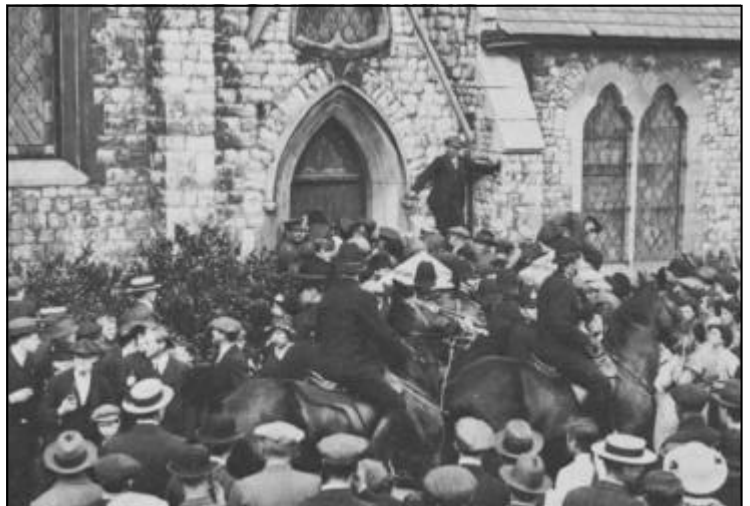
Anti-war meeting 1917

To deal with the expected opposition to conscription, the government had included a section in the Military Service Bill known as the 'conscience clause'. This allowed people exemption from conscription 'on the ground of a conscientious objection to the undertaking of combatant service'. The government knew there