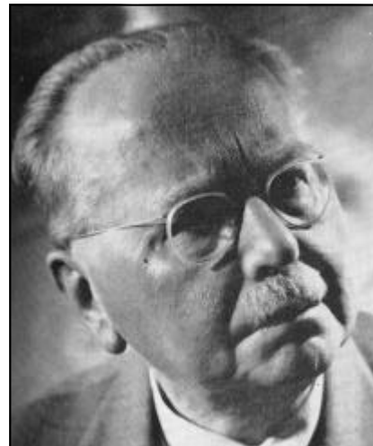
Friedrich Siegmund-Schültze

By early 1915 there were 1,500 people enrolled in the FOR and 55 branches throughout the UK - including London, Bournemouth, Burnley, Manchester, Leicester, Bristol and Reading. By 1916 there were 84 branches and 4,820 people enrolled, and by 1917 this had grown to 7,000.