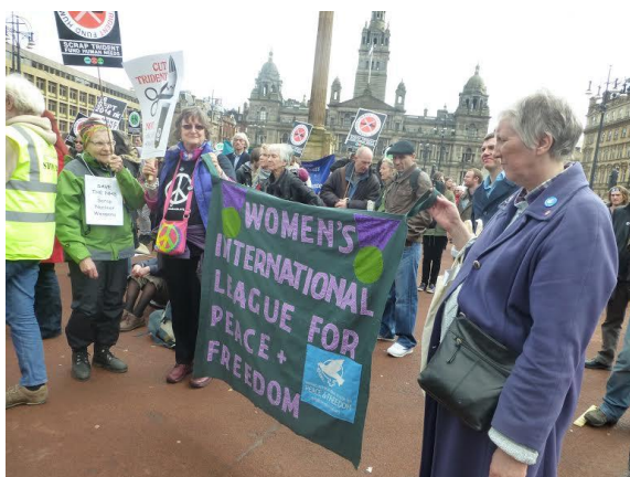
Anti-Trident (UK Nuclear) Weapons Demonstration Glasgow, Scotland Branch