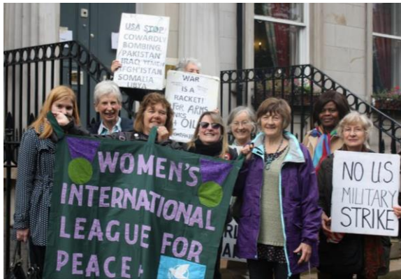
Syria Demo American Consulate Edinburgh: against the proposed bombing of Syria, Scottish WILPF members and friends