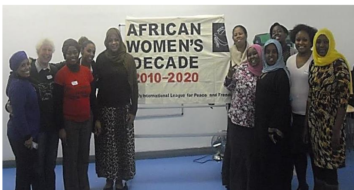
VOAW Training for Trainers Day: training against gender based violence November 30th, during the 16 days of Action against Gender Violence